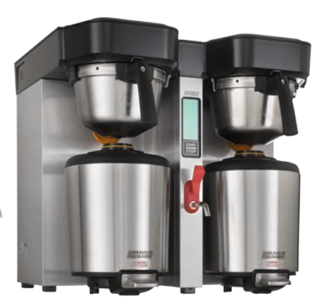
Twin Low (TWL)