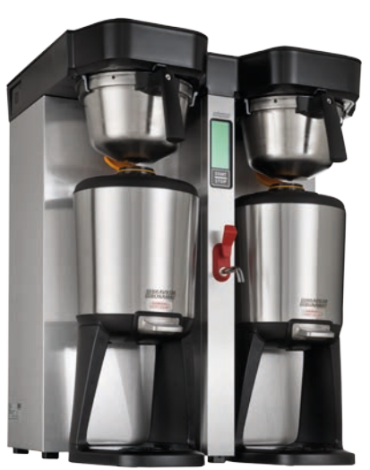
Twin High (TWH)