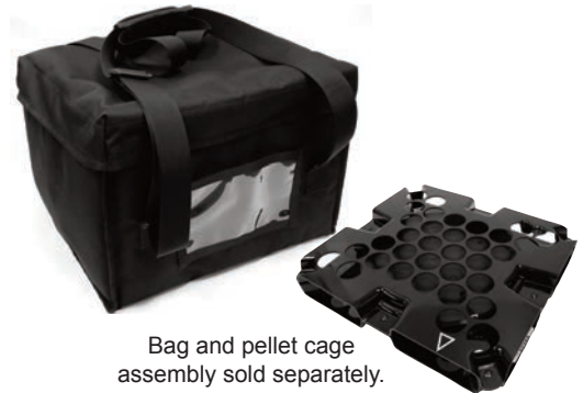
Bag and pellet cage assembly sold separately. Standard bag is black.

Note: For use with CookTek® TCS System specific heated delivery bags and pellet cage assemblies only.