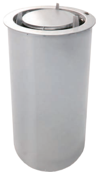
Plate Lowerator Countersunk

“Anvil’s Plate Lowerator will keep your plates warm at the desired temperature”