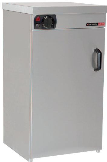
Plate Warmer Cabinet Single Door

“Anvil’s Plate Warmer Cabinet has been designed to keep up to 60 plates at the ideal serving temperature.”